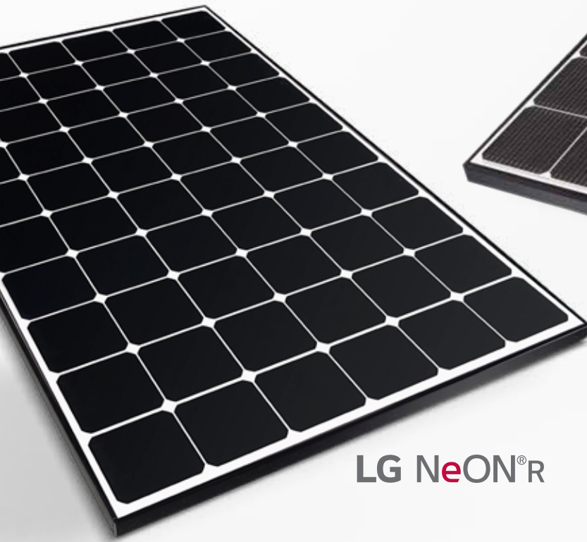
LG NeON ® R