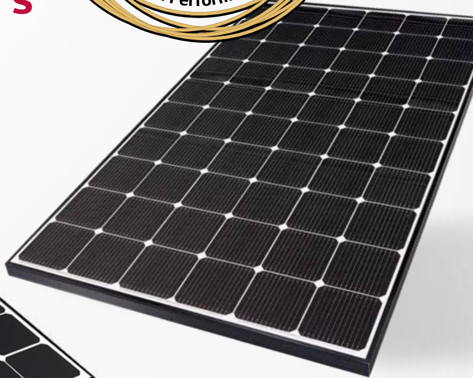
LG NeON ® 2